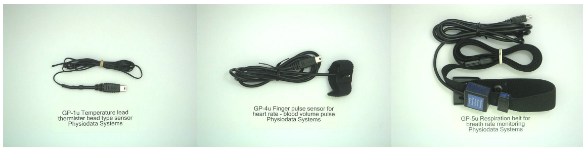
GP-1u Temperature sensor Thermistor bead type